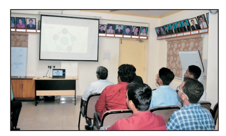
Seminar on Critical Analysis on Accounting Standards Overview & Latest Updates on Auditing Standards held on 9th December, 2023